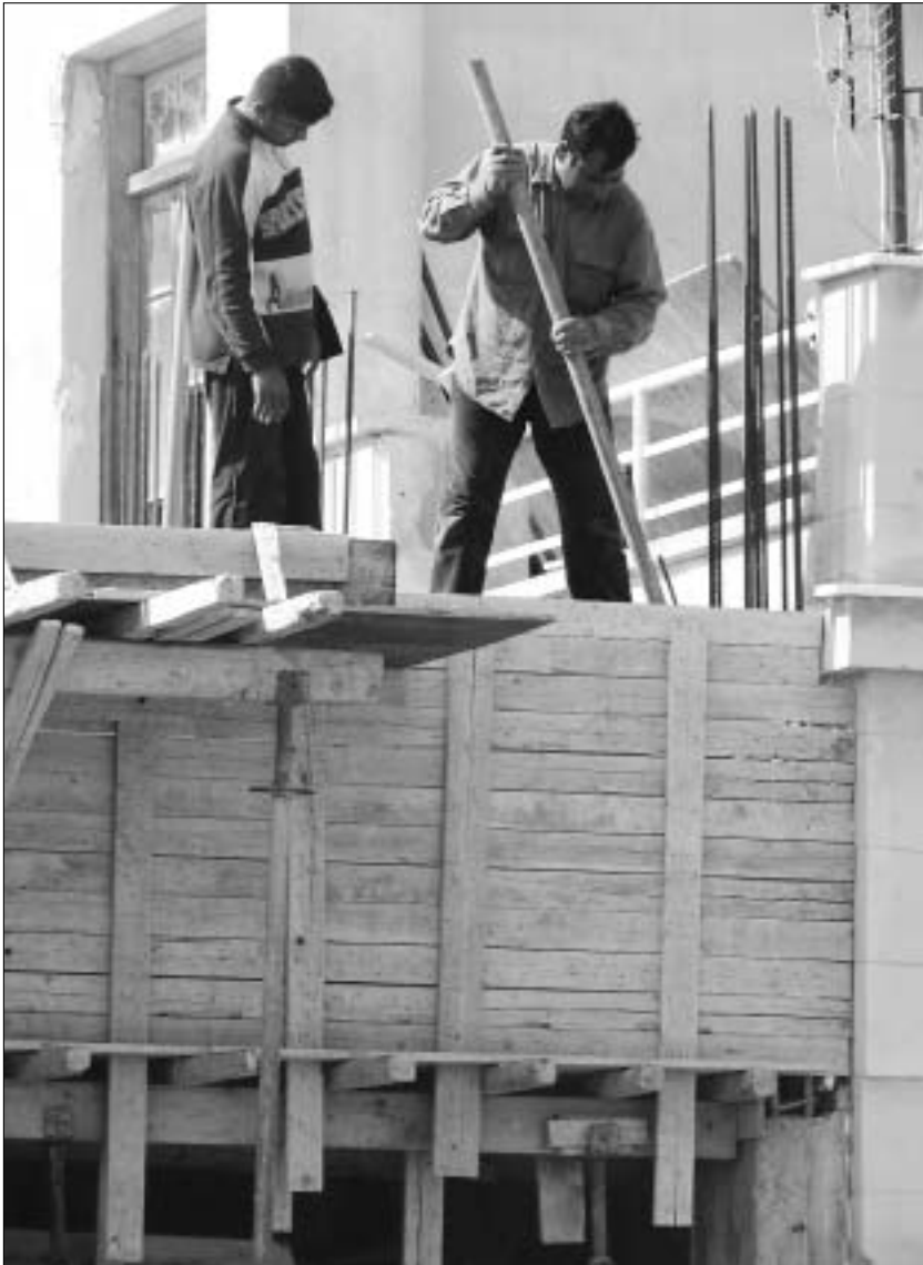
Migrant worker at construction site near the Green Line